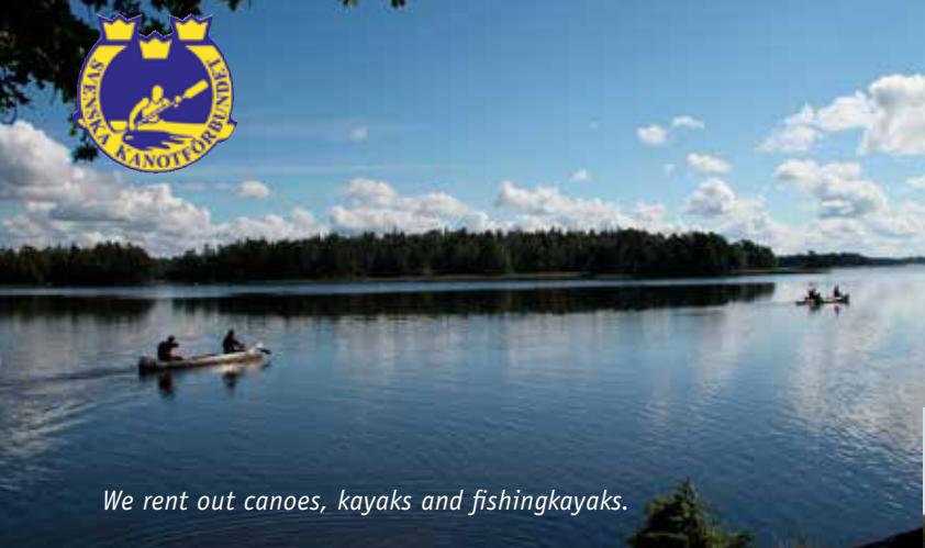
We rent out canoes, kayaks and fishingkayaks.