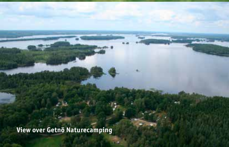
View over Getnö Naturecamping

Enjoy our beautiful nature on Getnö Gård!