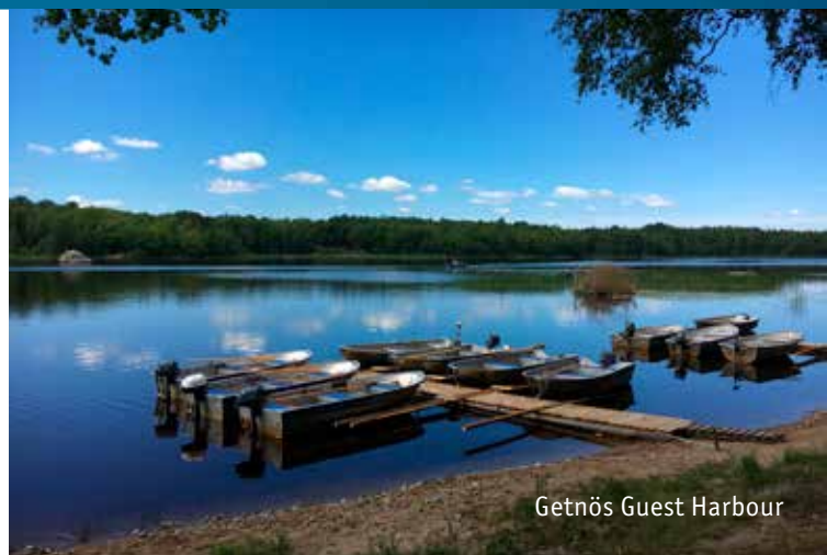
Getnös Guest Harbour

We have touring bikes for rental. There are many Bicycle Trails in the area, such as "Åsnen Runt", "Banvallsleden" and "Sydostleden". We can also offer E-bikes, MTB and Cargo bikes in cooperation with RentBike in Växjö.