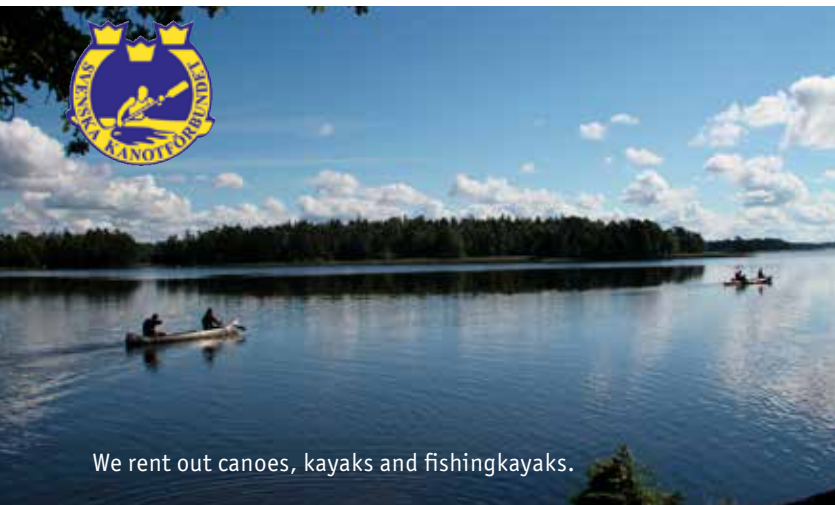
We rent out canoes, kayaks and fishing kayaks.