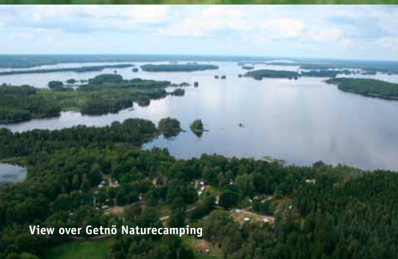
View over Getnö Naturecamping

Enjoy our beautiful nature on Getnö Gård!