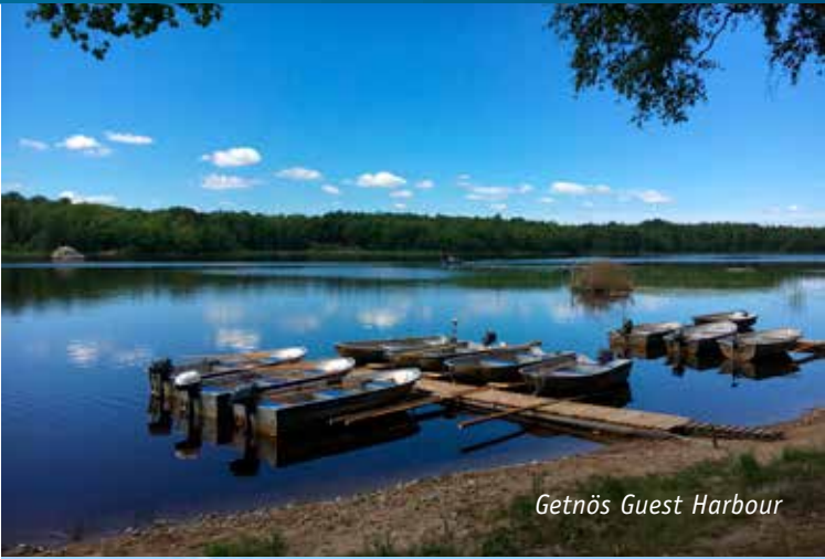
Getnös Guest Harbour

We have touring bikes for rental. There are many Bicycles Trails in the area, such as "Åsnen Runt", "Banvallsleden" and "Sydostleden". We can also offer Electro-bikes and MTB in cooperation with RentBike in Växjö.